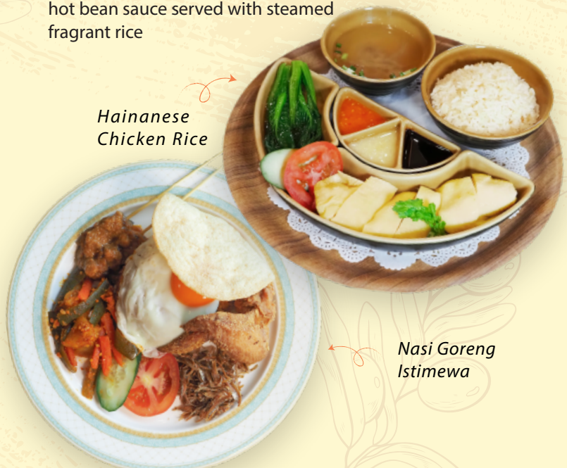
Nasi Goreng Istimewa