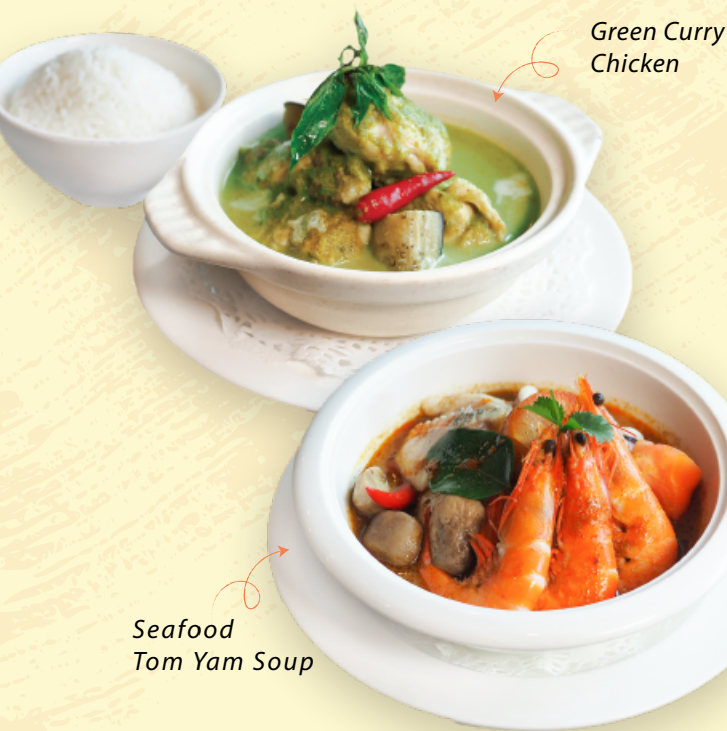
Green Curry Chicken