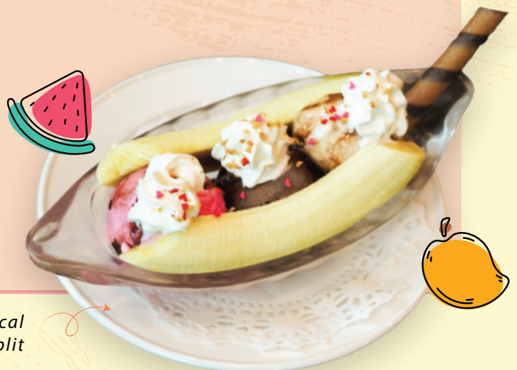
Tropical Banana Split