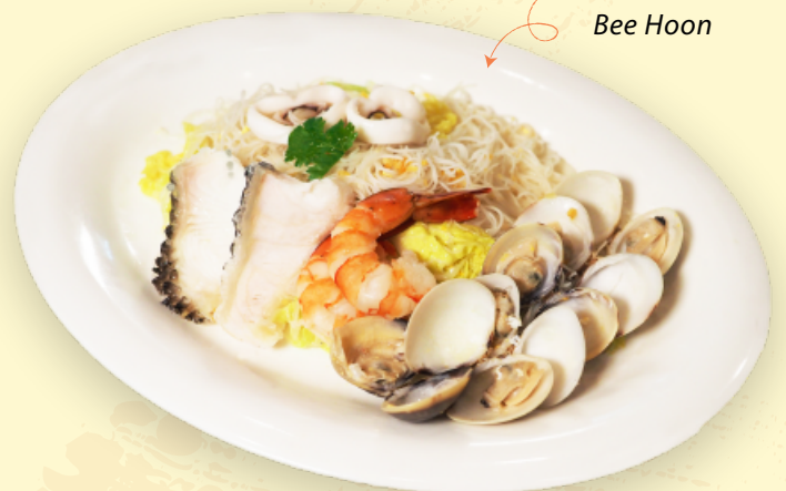
Seafood White Bee Hoon