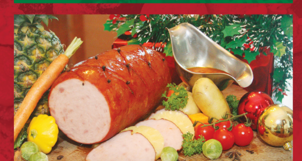
Roasted Honey-glazed Ham