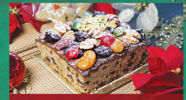
Christmas Fruit Cake

Complete your Christmas feast with sweet desserts. Satisfy your sweet tooth with the awesome handcrafted tasty treats!