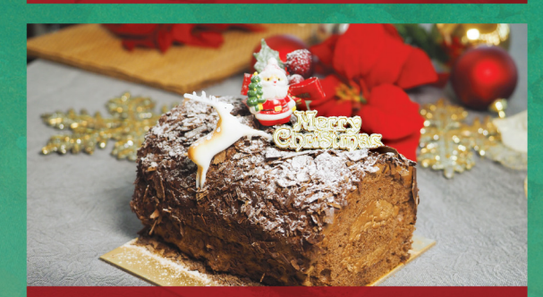
Christmas Log Cake